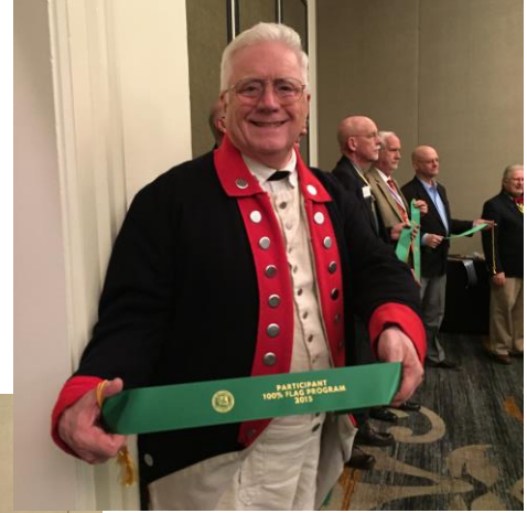
Fairfax Resolves had a near clean sweep of 2015 flag streamers