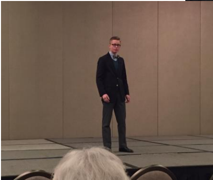
Fairfax Resolves Chapter's 1 st place winner placed 3 rd at the VASSAR oration runoff.